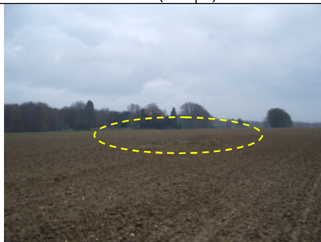
Indice 21 – photo 1