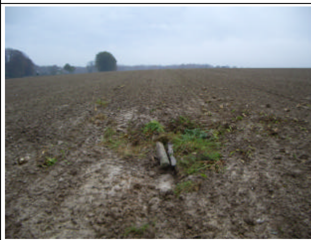
Indice 21 – photo 2